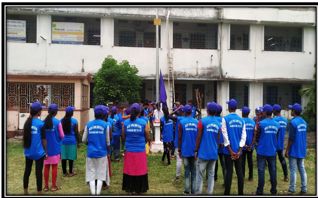
Observance of NSS Day